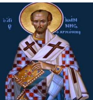
Icon of St. Chrysostom the Hierarch